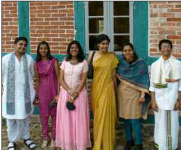
Group of happy Young Ambassadors in Germany, they had yet to taste Sausage and Kraut! The Germans were proud to have had you in with them.