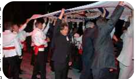
French 41'ers rushing to take cover as the rains came down!

Amazing Show spectacle, splendid photographs always a new surprise during the whole evening loaded with emotion, from which the most mov-