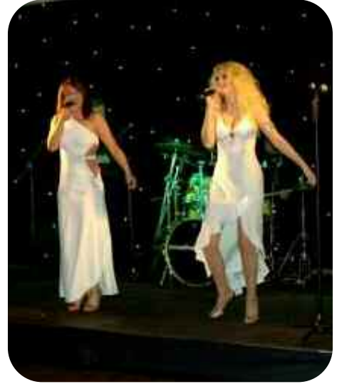
No mistaking these two buggers. They did not even have to dress up