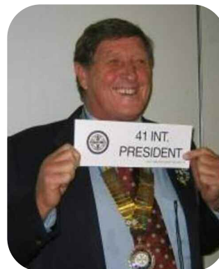
Spotted in Finland, the Finns were not too sure how to spell Jööhn Hüüdsön! ... International seemed to have caused some trouble too!