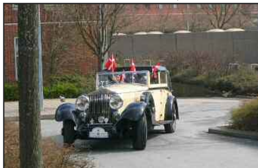
No, they did not arrive on Elephants!

Finally, I like to encourage those nations, which have not yet participated in YAP to join the programme. It is an expedient and great undertaking which enriches your own club life and helps to make 41 INTERNATIONAL more attractive to everybody. We have the facility to extend the programme. I have a lot of idea: for instance, there could be